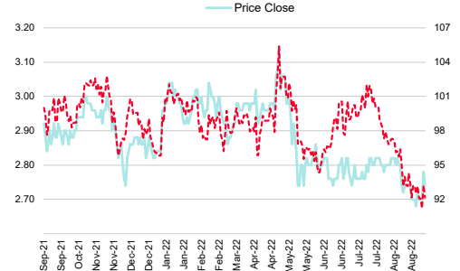
Dynasty Ceramic PCL (DCC TB)